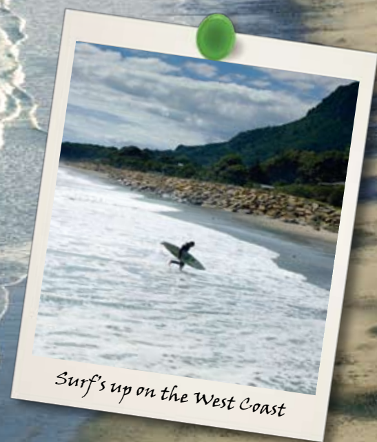
Surf's up on the West Coast