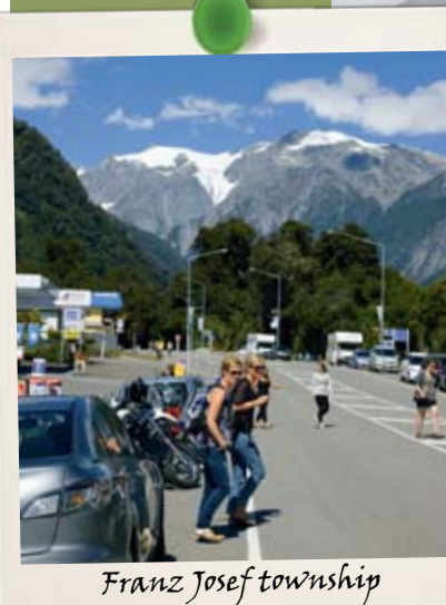
Franz Josef township