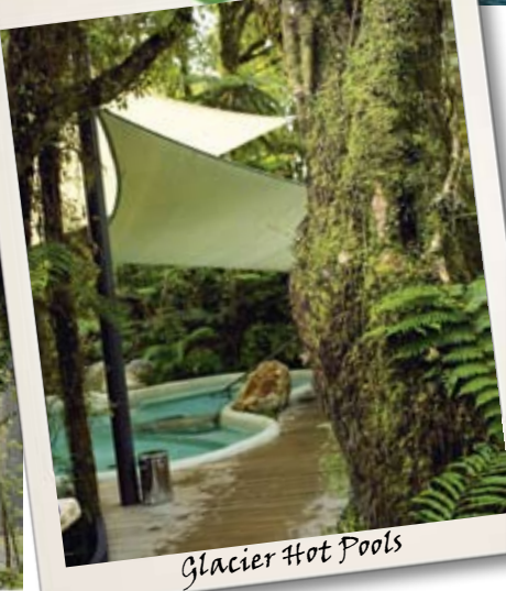
Glacier Hot Pools