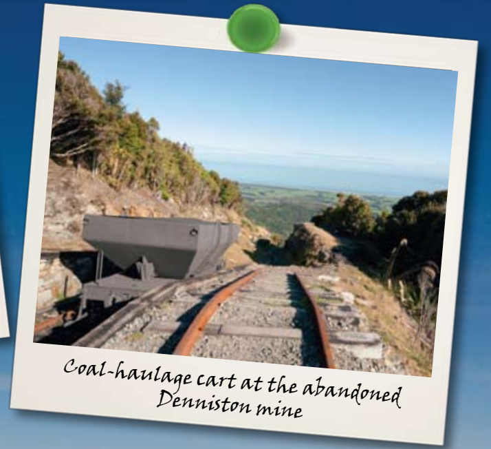
Coal-haulage cart at the abandoned Denniston mine