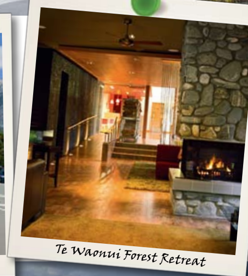
Te Waonui Forest Retreat